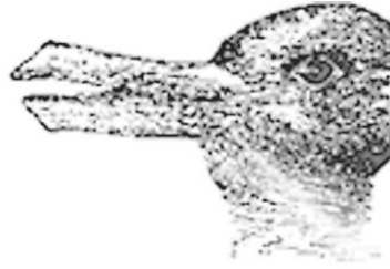
FIGURE 1. Duck-Rabbit.