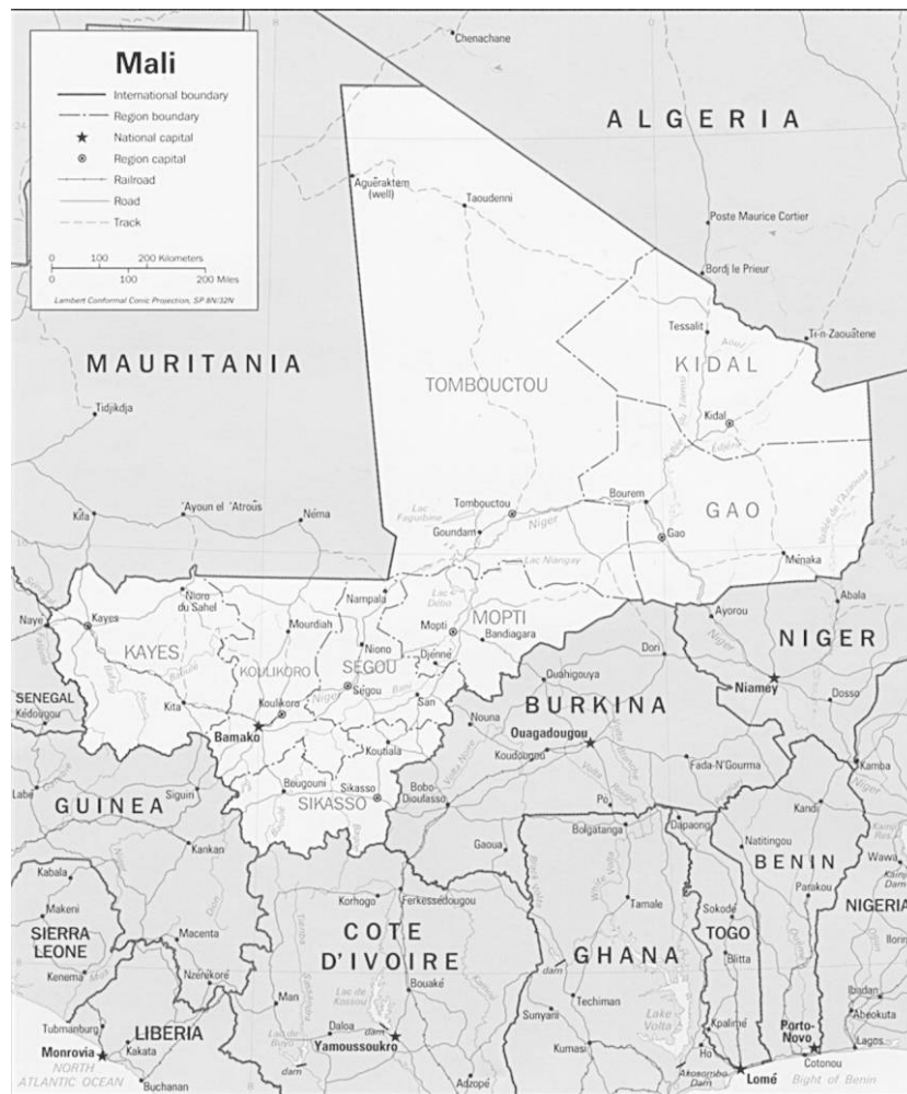
FIGURE 4. Map of Mali.

in the village of Neba, which is twenty-five miles northeast of Sikasso in southeastern Mali. Sikasso is Mali's second largest city (fig. 4). The Kenedougou region (as the area around Sikasso is known) is one of Mali's richest agricultural areas (known for cotton, rice, millet, corn, vegetables, and fruit) and has the country's highest annual rainfall (fifty-five inches per year). The landscape is savannah—rolling hills with shrubs and widely spaced trees. Agricultural labor is done by hand and is backbreaking. As a child, Neba Solo herded cattle and learned to be a farmer as well as a musician. He was not sent to school but became literate as an adult through taking a course