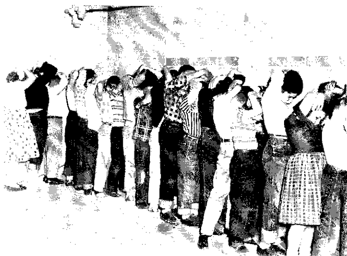
Still from Atomic Café , by the Archives Project (1982): Official Civil Defense Photo. Courtesy of the Museum of Modern Art.

Andreas Huyssen neatly sums up the affinities of the Atomic Café footage with the Fluxus avant-garde movement of the 1950s: "The insidious dialectic of mere accident and total rational control is perhaps nowhere as evident as in the ultimate Fluxus event of the 1950s, one performed millions of times over, but never by a Fluxus artist: schoolchildren line up, arms covering their heads, in nuclear war drills. Nuclear war was, after all, the trauma of the 1950s generation." 37 Huyssen implies that the image taken from Atomic Café is of real children, performing a real drill. And yet the film footage is necessarily a propaganda document, and thus a performance of a drill. Atomic Café could only be a found-footage film because it is about the representation of rational control, which falls apart precisely on its fabricated status, its void of referentiality. The children in this image are performing their fear of nuclear holocaust, but it is only a paranoid symptom of the apparatus of power that has created the image, to circulate as a perpetuation of the paranoia, to augment its power, and so on.