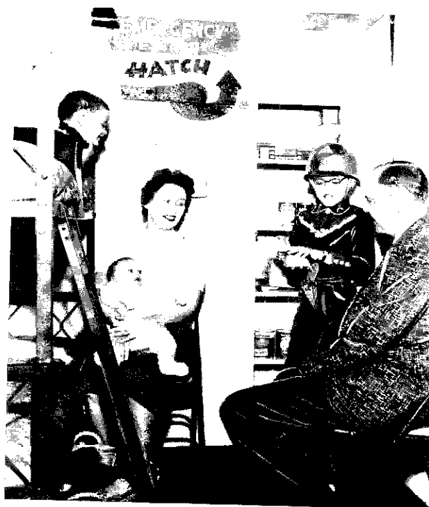
Still from Atomic Café , by the Archives Project (1982): Official Civil Defense Photo. Courtesy of the Museum of Modern Art.

and in their absence, the film points to their annihilation within atomic culture as it displaces reality with a simulated version.