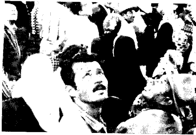
Still from Tribulation 99 , by Craig Baldwin (1991).

ture. The discontinuity of catastrophe is once again symptomatic of apocalypse culture and its crisis of representation. Among the images of disaster are an earthquake in Nicaragua (possibly filmed in miniature) and the same swaying suspension bridge seen in A Movie , 43 plus a slew of plane crashes and explosions. As a postmodern variant of A Movie , Baldwin's film inscribes a discourse of political activism in which the ethnographic is not a mute signifier of historiographic memory but a sign of historical trauma. In the void created by the onslaught of images, the possibility of historical resistance to the military-industrial complex is eclipsed. This is the real crisis of the film, its traumatic undercurrent. Baldwin can address neocolonialism only as a problem of representation, not of history; the film has no access to the "truth" of U.S. intervention in Central and South America, as the media "cover-up" has become a totalizing form of coverage.