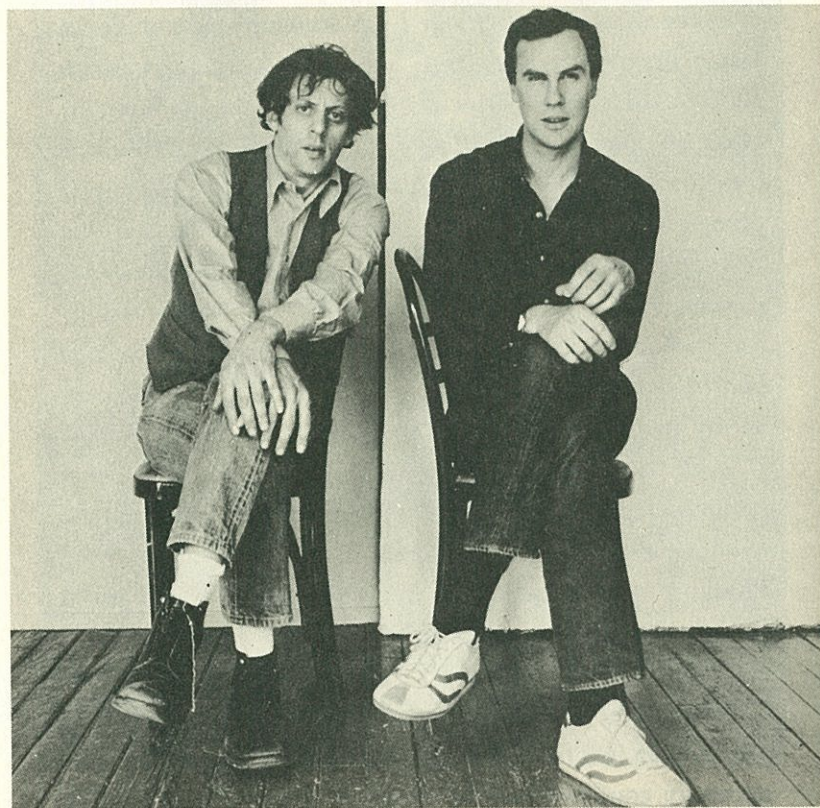
"Bob Wilson holds me, but I cannot say why . . ."

R. MAPPLETHORPE: PHIL GLASS AND BOB WILSON