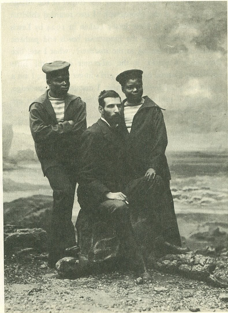
"The punctum, for me, is the second boy's crossed arms . . ."

name; it is sharp and yet lands in a vague zone of myself; it is acute yet muffled, it cries out in silence. Odd contradiction: a floating flash.