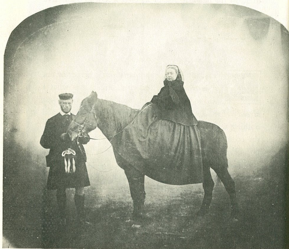
"Queen Victoria, entirely unesthetic..." (Virginia Woolf)