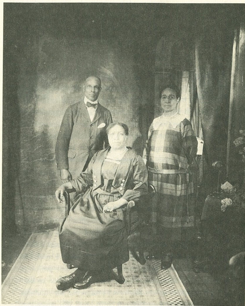
The strapped pumps

JAMES VAN DER ZEE. FAMILY PORTRAIT. 1926