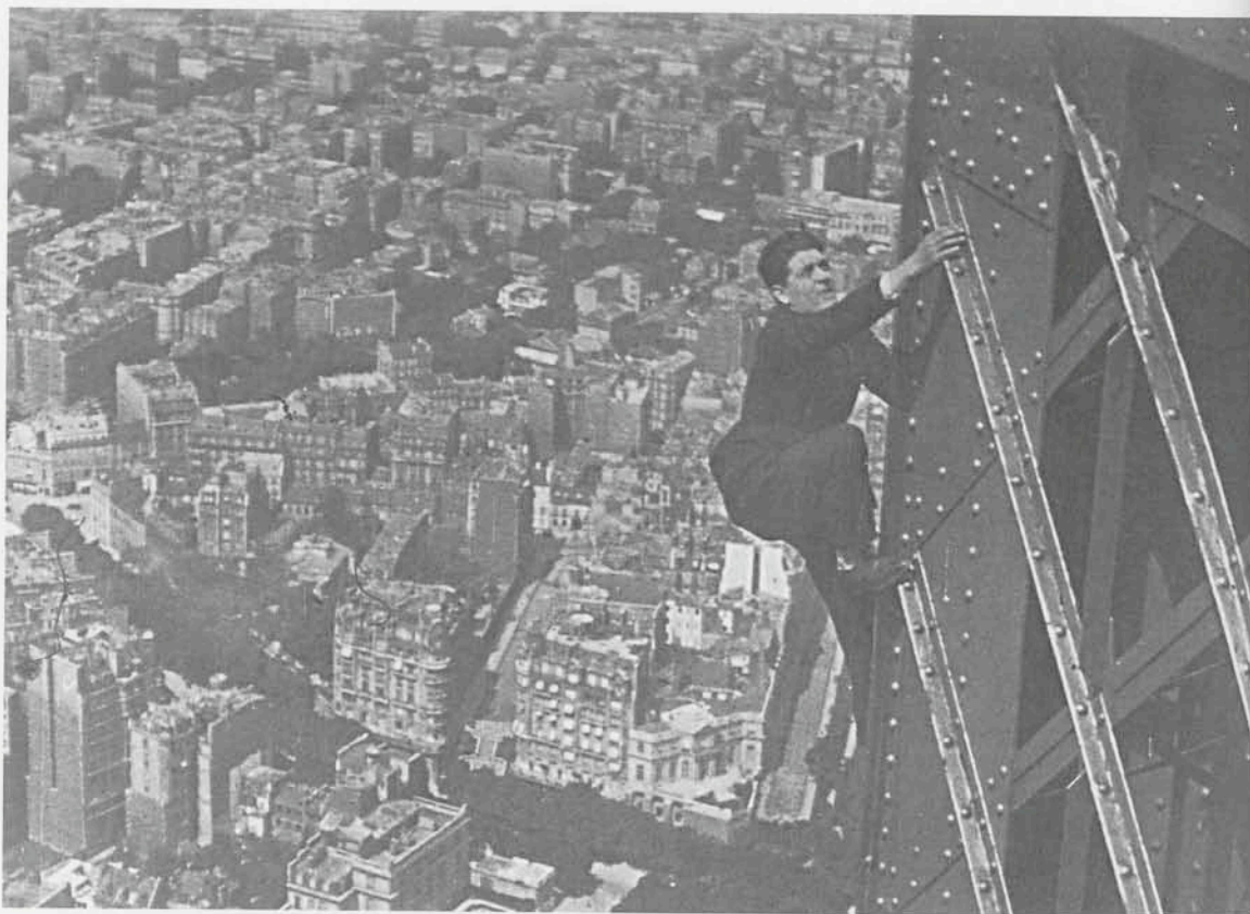
The fantasy begins in René Clair's Paris qui Dort (1925) when Dr. Craze uses a paralyzing ray machine to stop time. A few people escape the rays and decide to meet on the Eiffel Tower.

picture, it always contained illogical juxtapositions to other images to demonstrate a magical, irrational, hallucinatory, dream-like quality in the free association of forms. The surrealist approach to filmmaking was designed to shock the viewer by this visual displacement rather than to establish any logical or plausible explanation of the actions within the context of the scene.