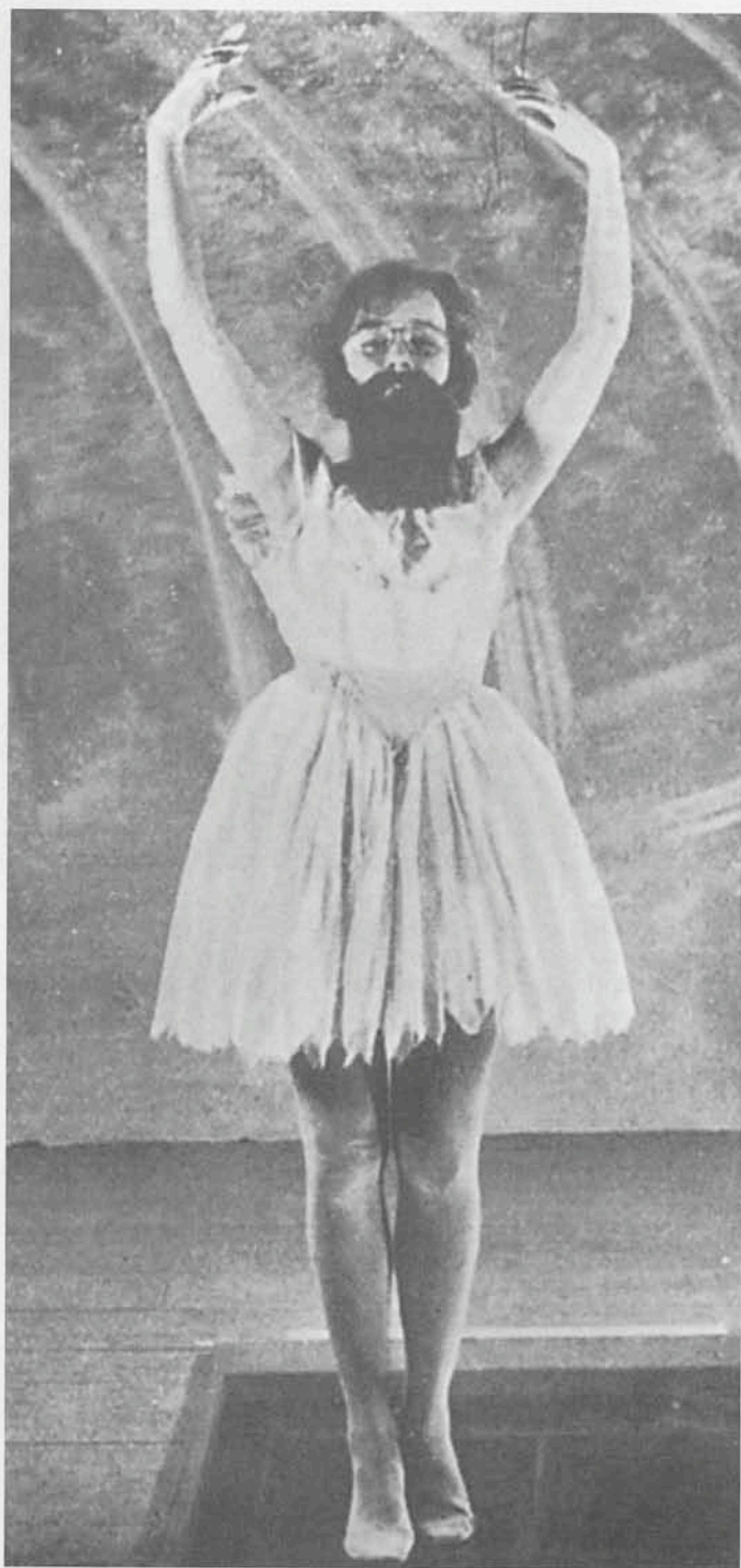
Rare René Clair's Entr'acte (1924) is a short film filled with editing sequences that serve Dada's goals of breaking away from "logic." In this sequence a ballerina is revealed to be a bearded man dancing in a tutu.

Another non-narrative experimental film that contains absurd humor and surreal displacements is Ballet Mécanique (1924). This experimental film was designed and directed by Fernand Léger to demonstrate his fascination with the spirited interplay of industrial forms and