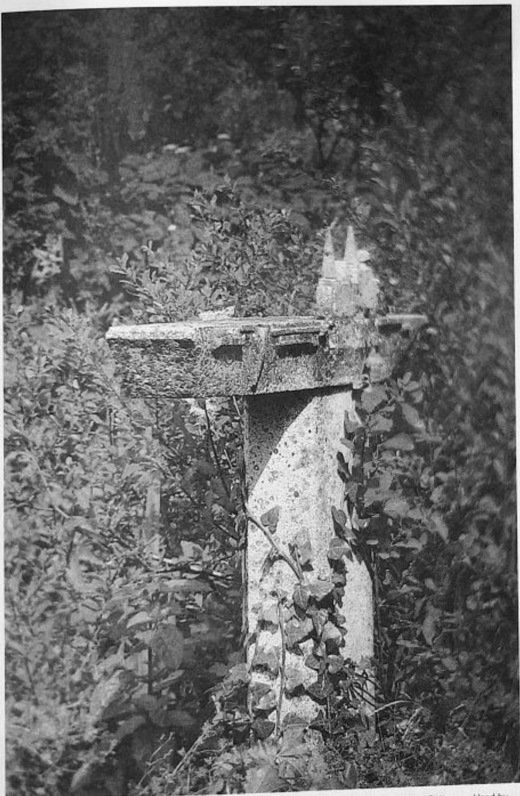
Figure 7. Aircraft Carrier, Bird Table, and the Temple Pool, Little Sparta, 1972. Photograph by David Patterson. Used by permission of Ian Hamilton Finlay.