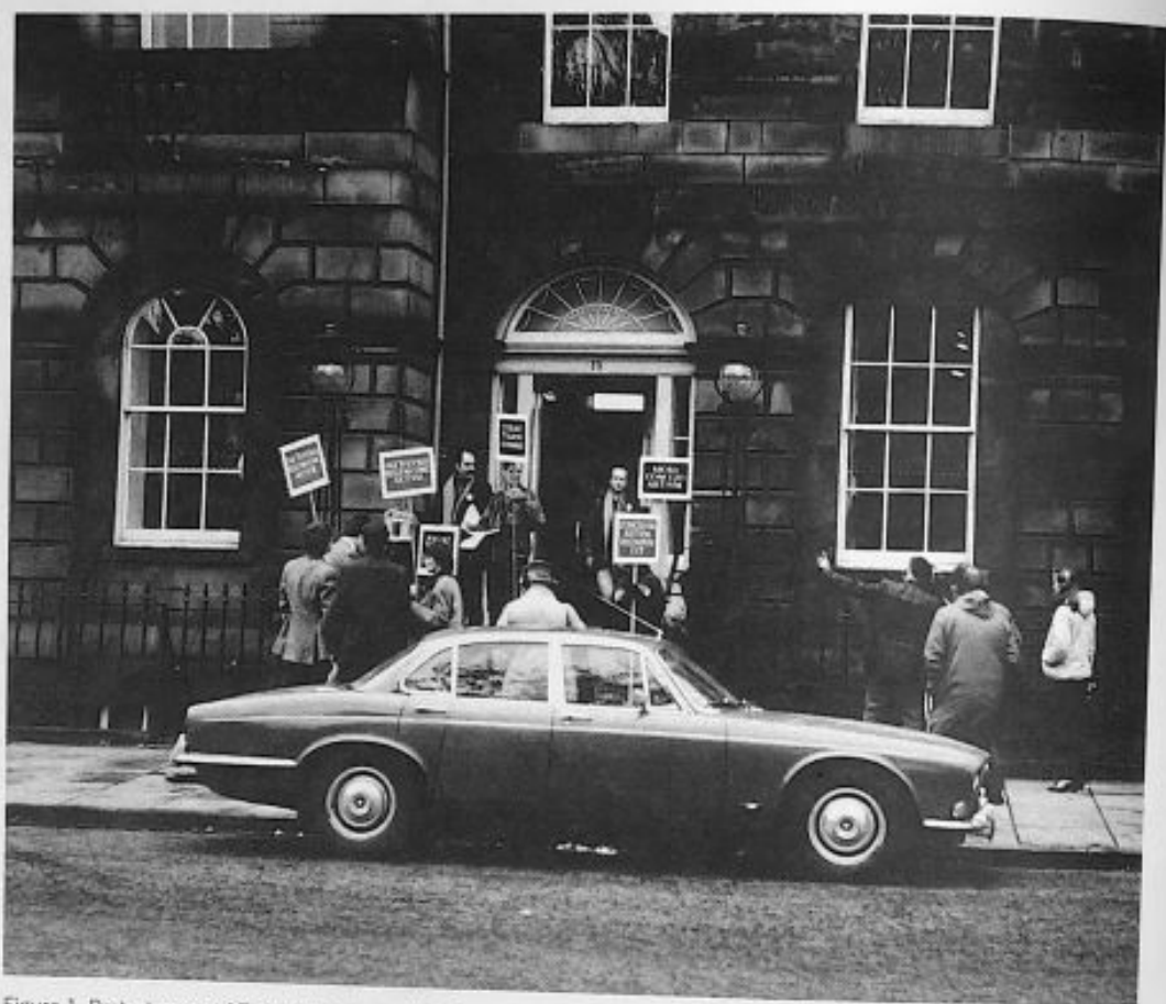
Figure 1. Protest group of Finlay supporters at the Scottish Arts Council, 1983.

the Vigilantes removed two of Finlay's neoclassical stone reliefs from Scottish Arts Council headquarters and installed them in the Garden Temple as war spoils; the garden was again opened. 6