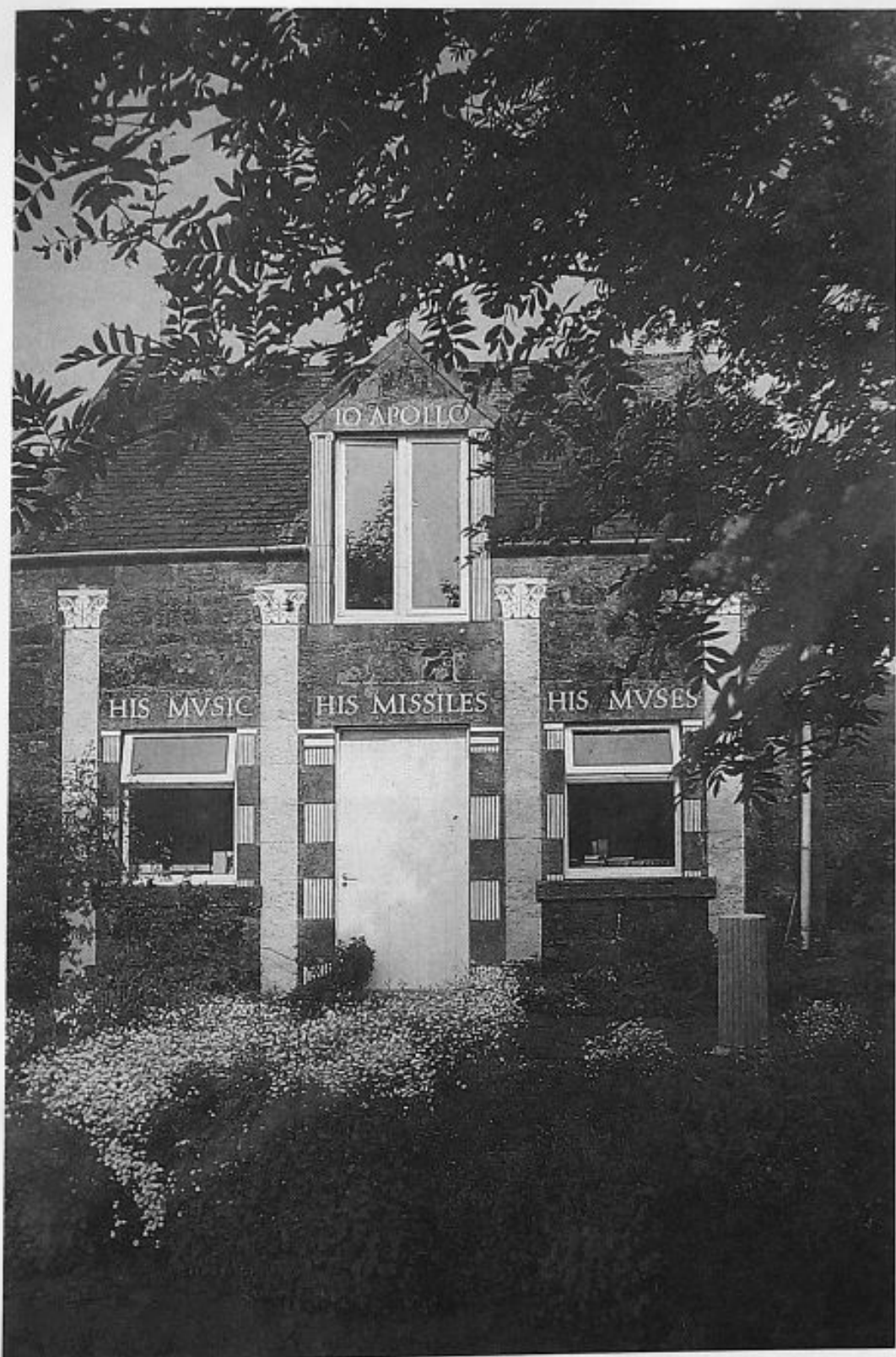
Figure 3. The Garden Temple, Little Sparta, 1982.