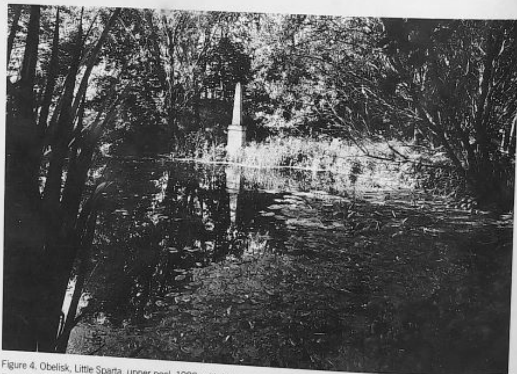
Figure 4. Obelisk, Little Sparta, upper pool, 1982, with Nicolas Sloan inscription "Il Riposo do Claudio."

The plants in Finlay's garden include rowans, ash, conifers, wild cherries, yellow elderberry, varieties of cornus , and ground plants such as geraniums, strawberries, lamium , ajuga , alchemilla , astilbes , brunnera , campanulas, hellebores, hostas, nepeta , saxifrages, sedums, and thymes; flowering plants include lilies, lupines, irises, astrantia , foxgloves, verbenas, yellow water iris and bulrush, soft rush, reeds and kingcups, and water lilies. 14 Finlay uses cherries as emblems of Rousseau, citing a famous passage in the philosopher's autobiography, 15 and he uses birches, which are difficult to grow at the site, as emblems of both extinction and discipline—"Bring back the birch" reads a stone inscription planted in a little grove of birches. But with these exceptions, the plants are not allegorical; they are, as Finlay explains, "whatever will grow." This philosophy of planting might be compared to a constructivist—or, more simply put, abstract—practice in painting, for plants are chosen on the basis of their