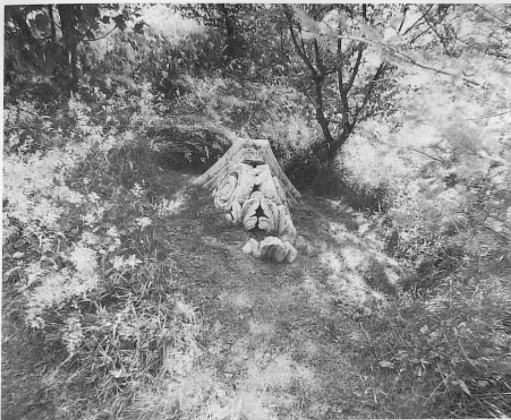
Figure 5. Buried Capital, Little Sparta (on path to upper pool), n.d. Photograph by Peter Davenport. Used by permission of Ian Hamilton Finlay.

horizontal and vertical relation to the overall composition, for textural reasons that are not engaged with celebrating the specificity of site. The plants are employed within a dialectic of shade and light, conifer versus perennial, that is associated with issues of the geometry of time. In the catalog for a 1984 exhibit, Talismans and Signifiers at the Graeme Murray Gallery in Edinburgh, Finlay cited Proclus on Euclid: "We should also accept what the followers of Apollonius say, that we have the idea of line when we ask only for a measurement of length, as of a road or a wall. And we can get a visual perception of line if we look at the middle division separating light from shaded areas, whether on the moon or on the earth." The "site" of Little Sparta is the descent of Western culture from the classical world. More specifically, the garden is built upon layers of allusion to the history of gardens, from the Gardens of the Hesperides to Blenheim, in juxtaposition to the history of revolutions and war.