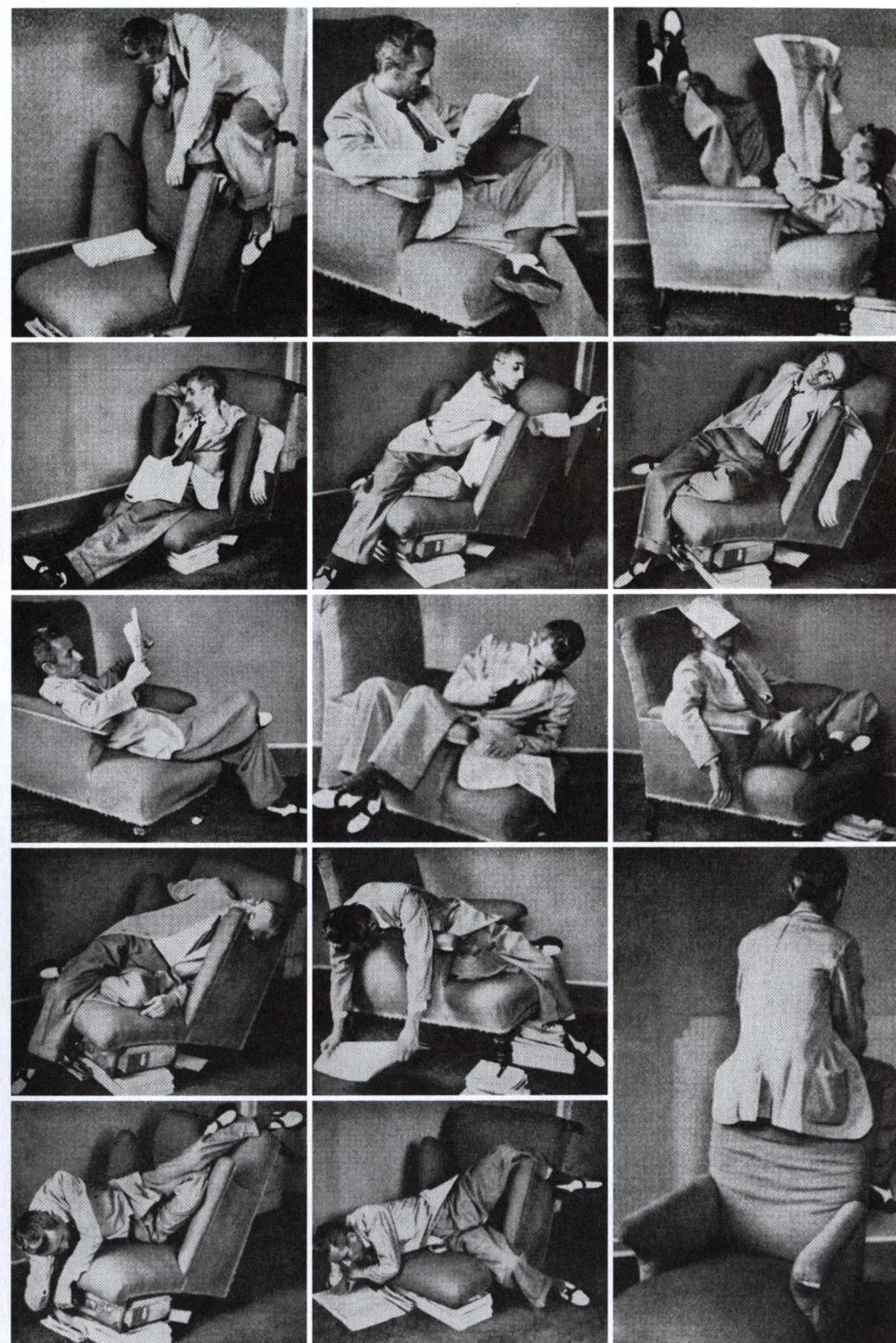
Bruno Munari, 'One comes home tired from working all day and finds an uncomfortable chair', from Domus , October 1944