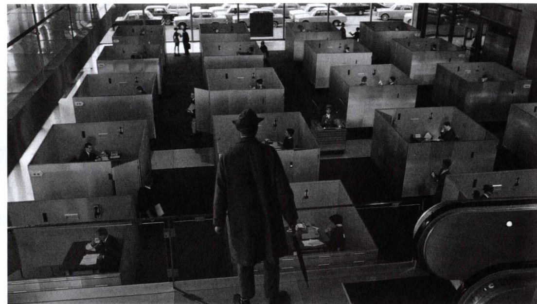
Jacques Tati, Playtime , 1967