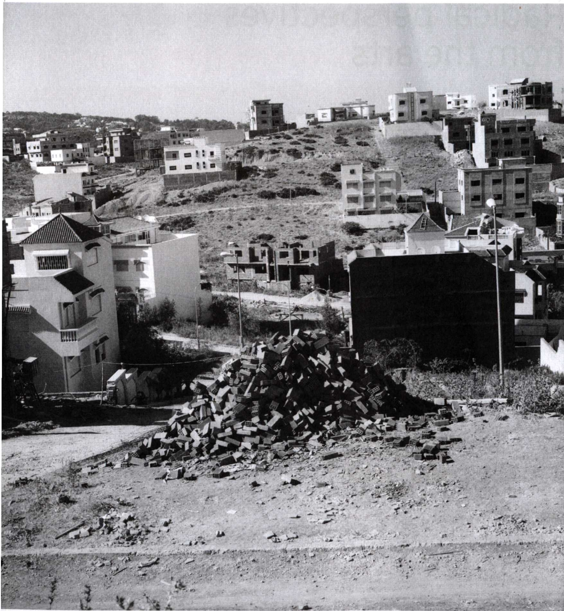
Yto Barrada, Briques (Bricks) (Backsteine) , 2003/2011