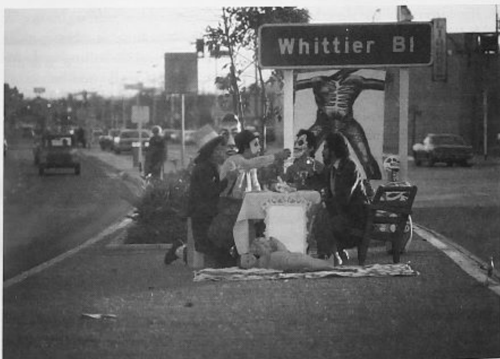
Figure 2. Asco, First Supper (after a Major Riot) , 1974, Photograph by Harry Gamboa Jr. Used by permission of the artist.